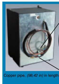
Copper pipe, (98,42 in) in length.

These fridges also feature interchangeable door hinges and front panels to suit a variety of installations.