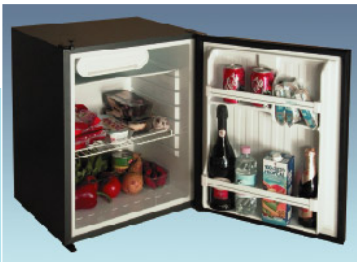
REFRIGERATED CABINET - 80 LITRES L. 18,5 in - P. 16,81 in - H 23,62 in

Frigoboats exclusive self sealing couplings allow the precharged system to be easily retro fitted.