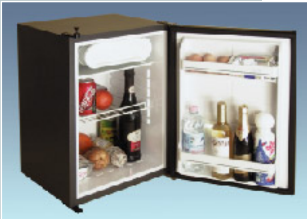
REFRIGERATED CABINET - 42 LITRES L. 14,96 in - P. 13,9 in - H 20 in