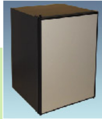
REFRIGERATED CABINET - 130 LITRES L. 20,66 in - P. 20,86 in - H 29,33 in